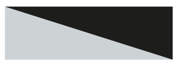
Splendid Silver with Midnight Black Roof