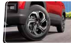
Bold Geometric Alloy Wheels

The Hot and Techy Brezza introduces a youthful and energetic design, ensuring you are ready for an adventurous drive in the city every day. Its commanding stance, impressive looks and precision detailing ensure that it never goes unnoticed. The City-Bred SUV comes with a clean Beltline with Bold Geometric Alloy Wheels, Dual Tone exteriors with a Shark Fin Antenna that enhances its design.