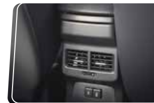
Rear AC Vents with Fast Charging USB Ports