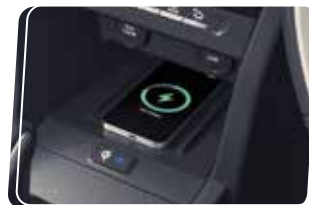
Wireless Charging Dock

The Hot and Techy Brezza carries a youthful and exciting appeal on the inside with your convenience at its core. It gets a unique design, modern and sleek look and black and brown interiors with silver accents for a sporty and urban feel. The City-Bred SUV also has Rear AC Vents, a Fast Charging USB Port (Type A and C) and a flat bottom Steering Wheel for your enhanced comfort and convenience. The 6-Speed Automatic Transmission with Paddle Shifters and Telescopic Steering ensure you go on city adventures comfortably.