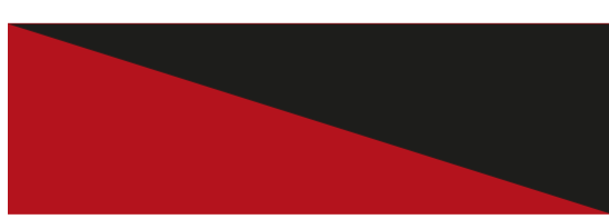
Sizzling Red with Midnight Black Roof