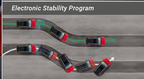
Electronic Stability Program