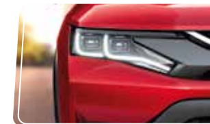
Dual LED Projector Headlamps with LED DRLs