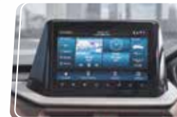
SmartPlay Pro+ with Surround Sense powered by ARKAMYS