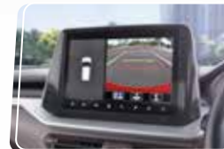
360 View Camera