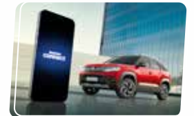
Next Gen Suzuki Connect