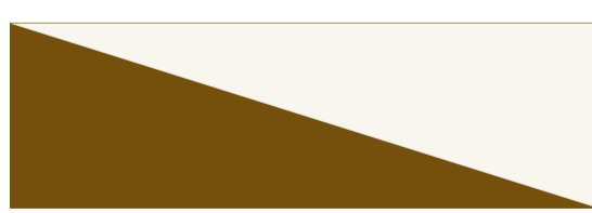
Brave Khakhi with Arctic White Roof