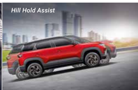
Hill Hold Assist