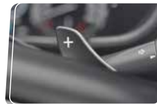
6-Speed AT with Paddle Shifters